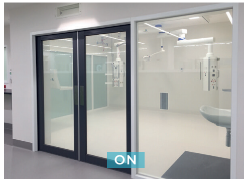
INTENSIVE CARE UNIT